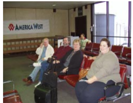
WAITING FOR THEIR FLIGHT